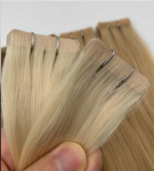
Invisible tape in