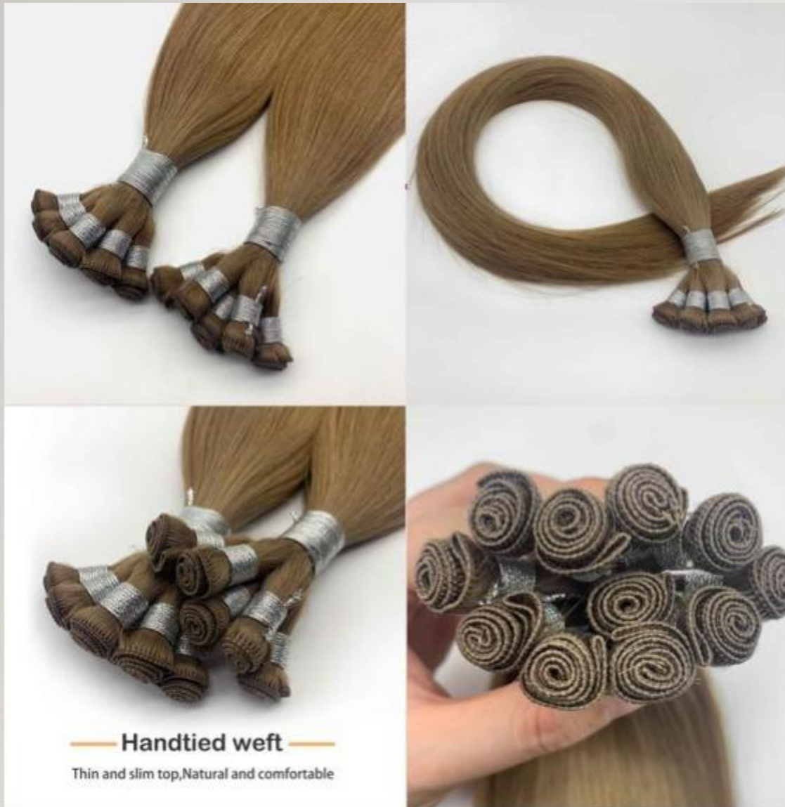
— Handtied weft — Thin and slim top,Natural and comfortable