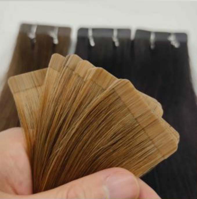
Regular tape in